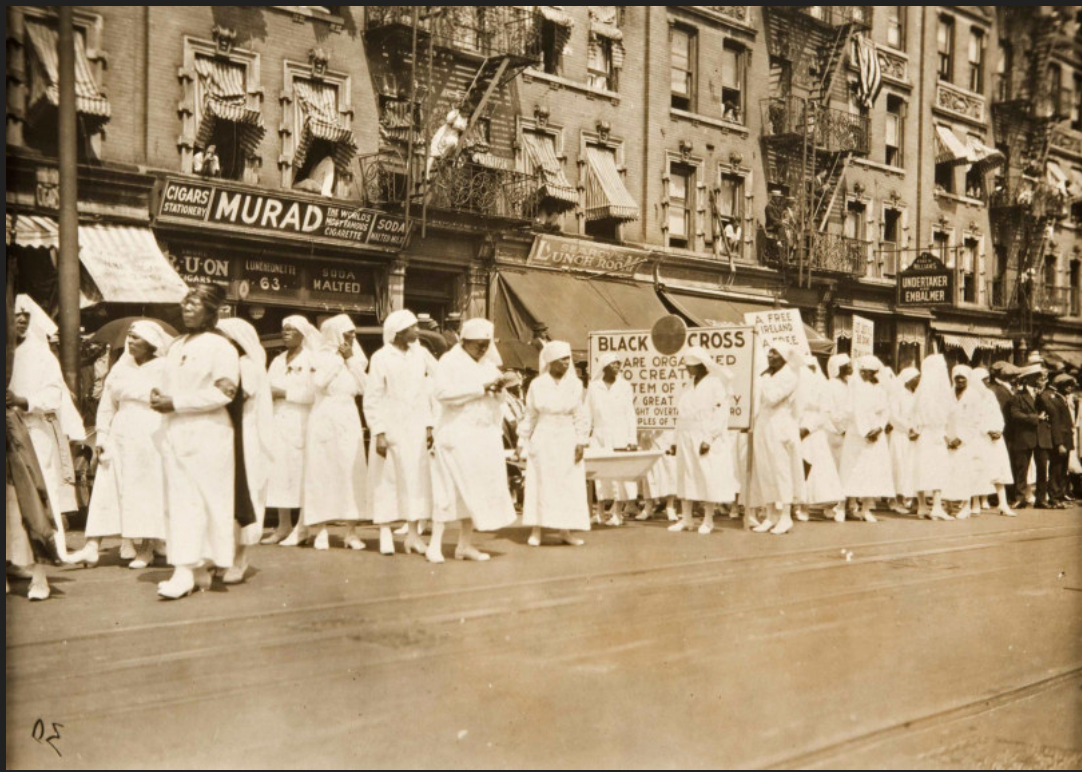
Van Der Zee, James (1886–1983) Black Red Cross March, Harlem, 1924 Silver print mat: 16 x 22 in. sheet: 5 x 7 in. Museum purchase; Acquisition Fund 1996.35

This exhibition features artwork created by Black Americans throughout the past century, up to the present day, starting with this photograph by James Van der Zee of the Black Red Cross March in Harlem from 1924.