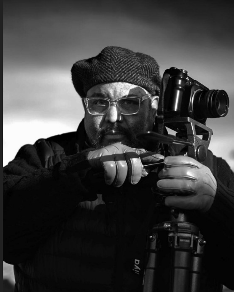
Dawoud Bey at Lake Erie, 2018.

In his photography, Bey explores, "how young people see themselves through the lens of race, gender, class, and culture".