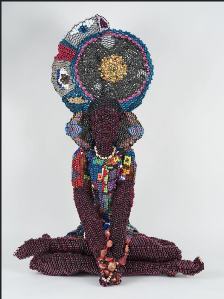
Joyce J. Scott, (b. 1948), Harriet Tubman as Buddha , 2017 Plastic and glass, beads, metal, thread, yarn and rocks, Museum purchase; Acquisition Fund 2018.15