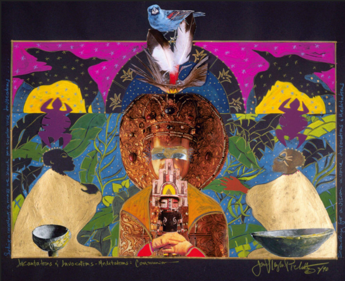
Janet Taylor Pickett, (b. 1948), Incantations and Invocations, 1990. Mixed media; Oil on canvas, opaque watercolor, metallic paint, colored crayons and cut out paper collage elements on black paper sheet: 18 x 24 ¼ in. Gift of Clarence Seniors 1992.6